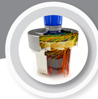
Research & Development